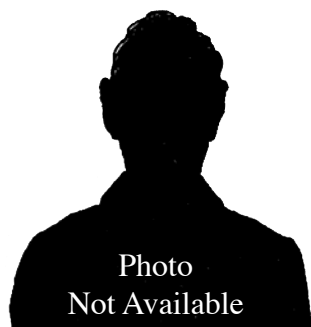
Photo Not Available